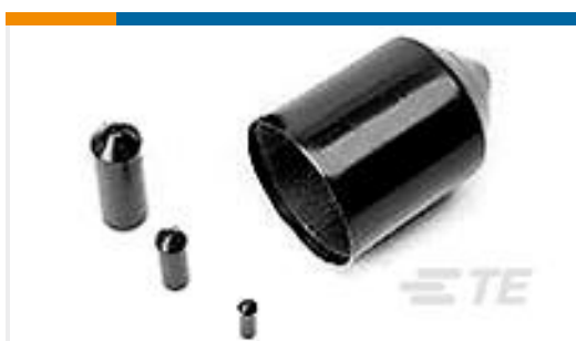
TE Part #843338-000 101A041-3/42-0