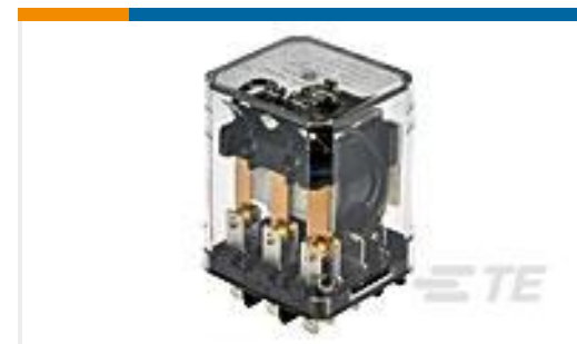
TE Part #1-1393118-7 KUP-14D15-48=KU