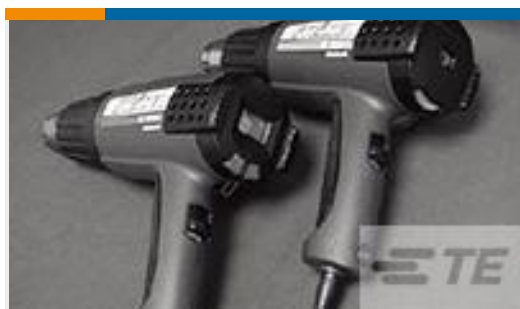
TE Part # CJ2087-000 HL2010E-KIT-120V