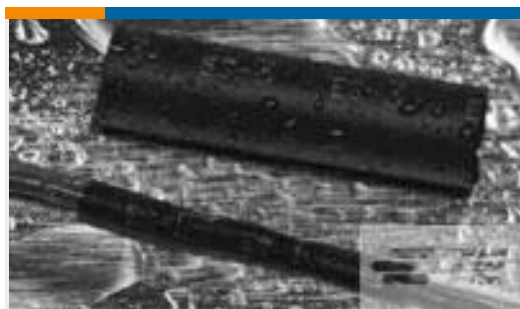
TE Part #063725P022 ES2000-NO.2-B9-0-STK