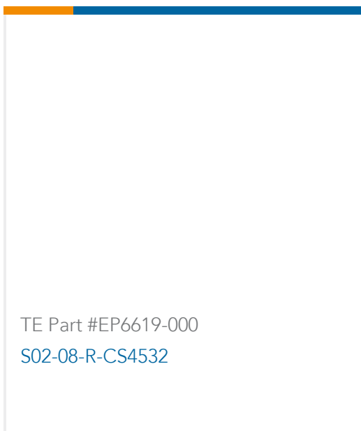
TE Part #EP6619-000 S02-08-R-CS4532