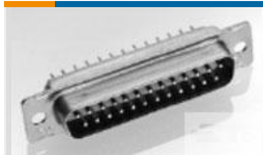
TE Part #1757820-2 AMPLIMITE,ASY,RCPT,STD,109,ZN,2