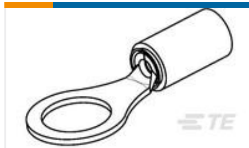
TE Part #1577642-1 TERMINAL RT PIDG PEEK STRATO 14-12 AWG