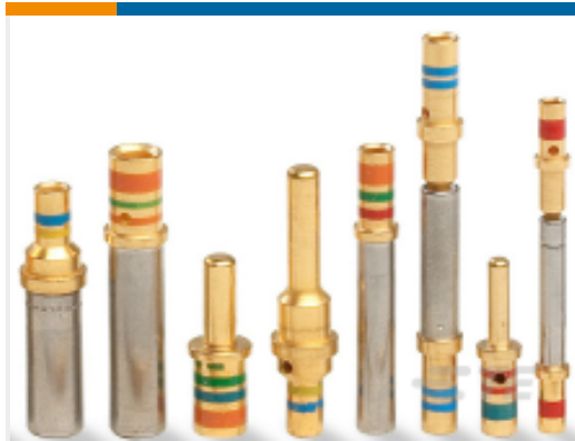
TE Part #0641-1-2031L CONT PIN