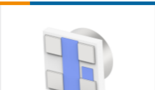
TE Part #20000980-00 MS5840-02BA21 LP T&R PRESS SEN