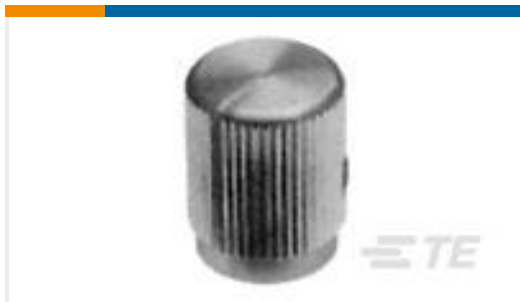
TE Part #1437622-7 KLN900B1/4=KNOB KNURL W/IND LI