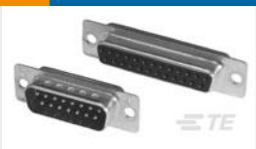
TE Part #5-747905-5 9 Rcpt Solder Cup, 30 gold, Ro