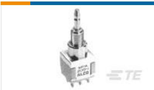
TE Part #3-1437567-1 MPA206N=SW P/B ON/OFF DPDT