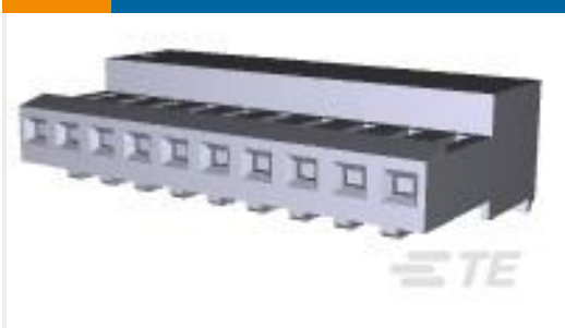
TE Part #4-641191-0 10P MTA100 CONN ASSY WHT LF