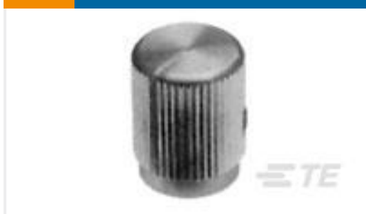
TE Part #1437622-2 KLN700A1/4=KNOB KNURL W/IND LI