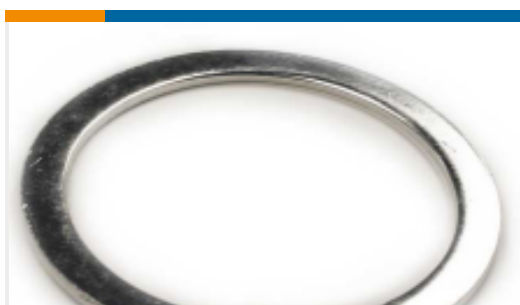
TE Part #112264-ZZ LOCKWASHER, SIZE 24, HD30