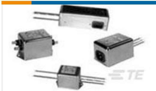
TE Part #6609048-6 6EQ3=F7263 S0