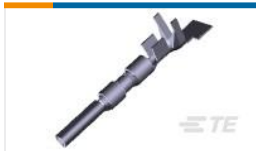
TE Part #1-794229-0 MINI UMNL2 SOK 22-18AWG LP LF