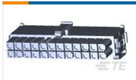
TE Part #794214-1 24P MINI UMNL2 PLUG HSG UL94V0