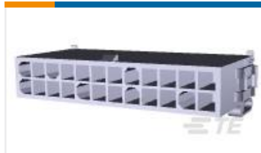
TE Part #794215-1 24P MINI UMNL2 CAP HSG UL94V0