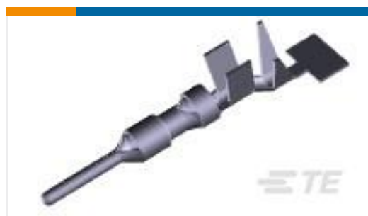
TE Part #1-794230-0 MINI UMNL2 PIN 20-16AWG LP LF