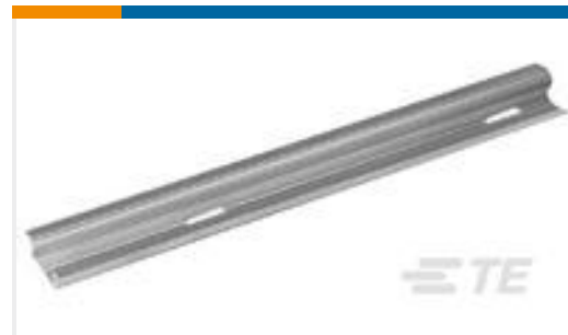
TE Part #1419111-6 24A110=TRACK,MOUNTING