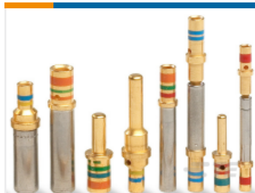
TE Part #38943-12L CONTACT T12 FEMELLE (= 724-0007-12)