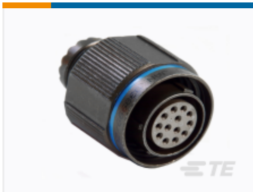
TE Part #YDTS26F15-19SCV001 PLUG ASSY