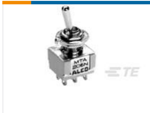
TE Part #2-1437558-0 MTA206N=(MSTA) SW TOG DPDT