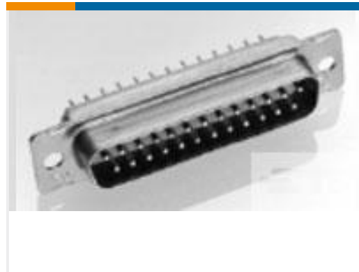
TE Part #1757820-8 AMPLIMITE,ASY,RCPT,STD,109,ZN,3,CT