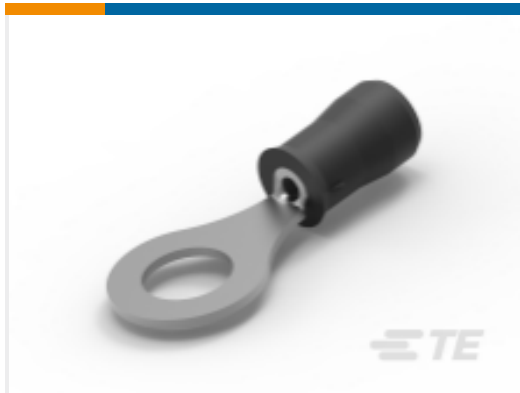
TE Part #36153 PIDG RING TONGUE TERMINALS