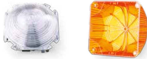
Internal diffuser and special lens pattern for optimal 360° signalling effect