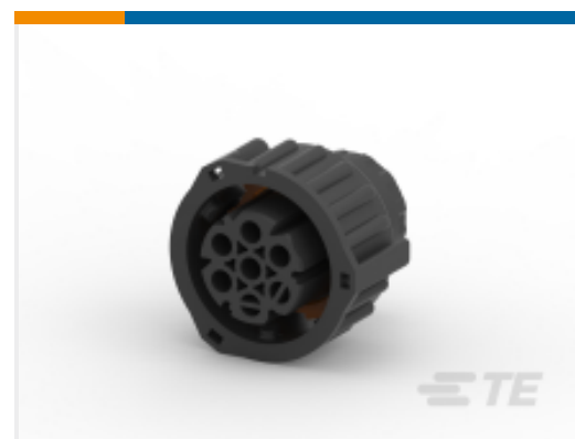
TE Part #967650-3 1,5MM BU-STE KPL 5P