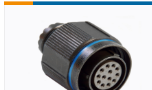
TE Part # YDTS26F13-04PNV001 PLUG ASSY