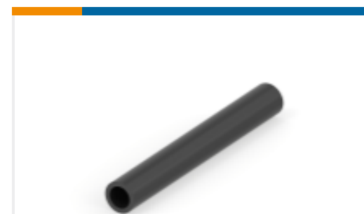
TE Part # NB15704001 RNF-150-1/2-0-SP