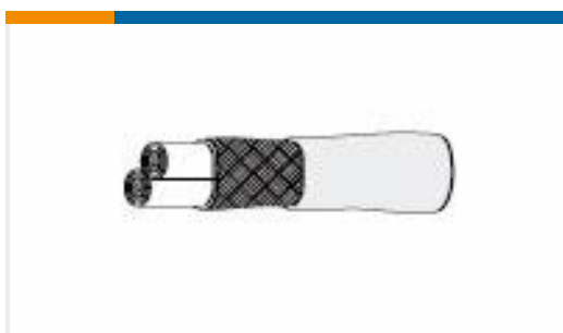
TE Part # 431891-000 55A1141-24-MST4-9CS2275