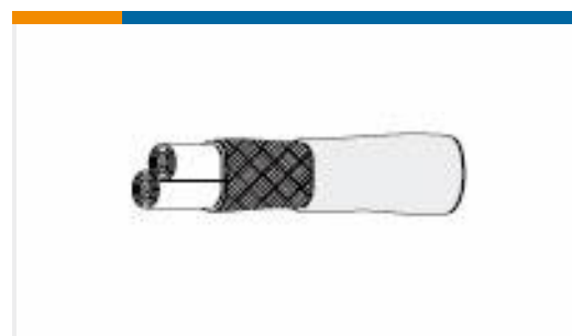
TE Part # 123421-000 55A1122-20-9/96-9CS2275