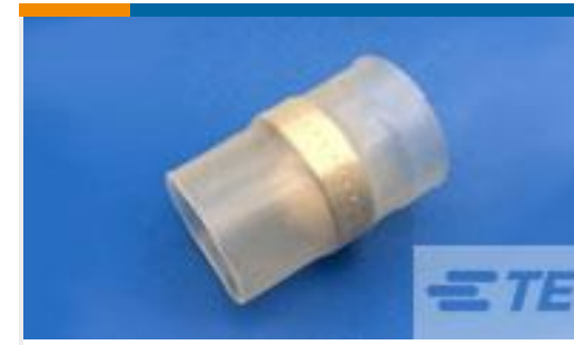
TE Part #696684-000 B-051-01-01