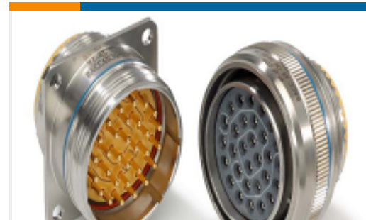
TE Part #ZPF000000000008007 983-1Y 10-05 P6