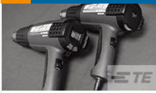
TE Part # CJ2087-000 HL2010E-KIT-120V