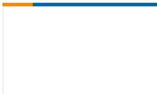
TE Part #ESC10YE10803P6B CONNECTOR ENGINE