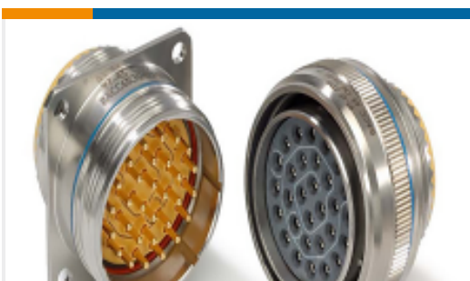
TE Part #ZPF000000000008008 983-1Y 10-05 PN