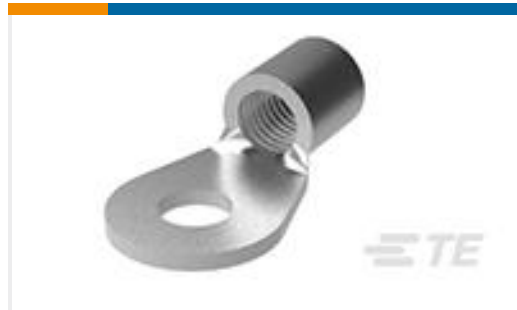
TE Part #31812 TERMINAL,SOLIS R 4 3/8