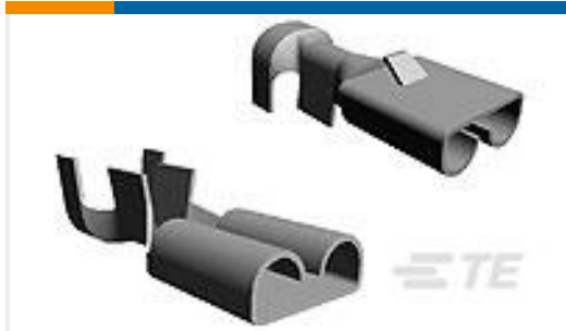
TE Part #6-160526-2 FF 250 REC 0.5-1.5MM2 TPPB