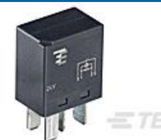
TE Part #6-1393292-3 V23074A2002A403-EV-CBOX