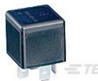
TE Part #1-1414167-0 V23134A0056X432-EV-CBOX