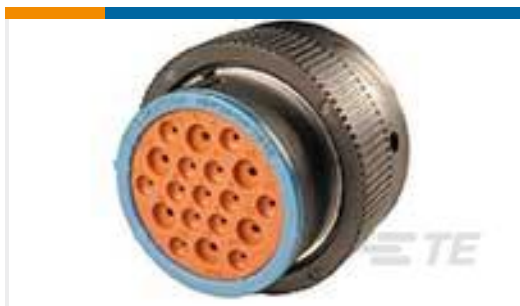
TE Part #HDP26-24-19SE PLG, 19P, BLK, E, 12/16, S