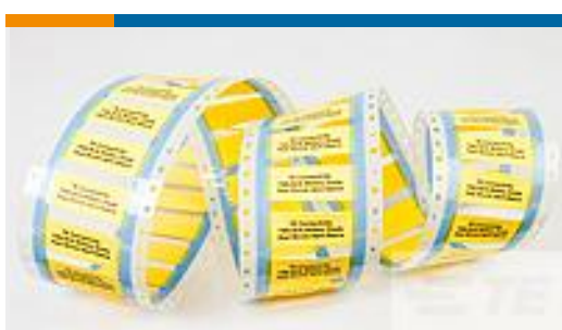
TE Part #4397130001 TMS-SCE-1-2.0-9