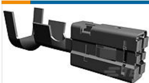
TE Part # 1-929153-1 MCP 9,5 (Loose Piece)