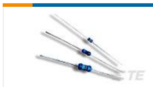
TE Part #1622486-1 LR1 1% 470R