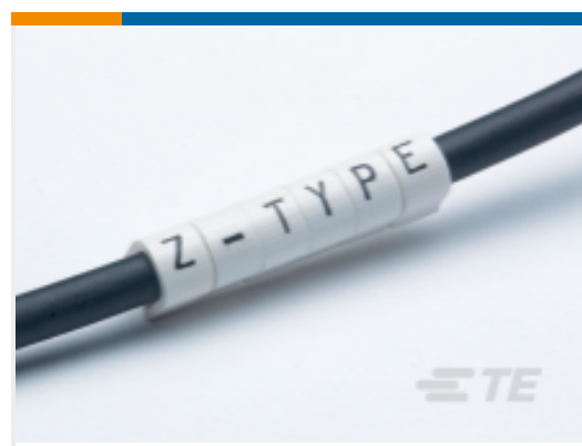
TE Part #EC0382-000 Z-TYPE PUSH-ON MARKERS