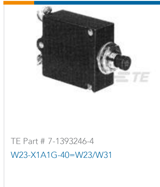
TE Part # 7-1393246-4 W23-X1A1G-40=W23/W31