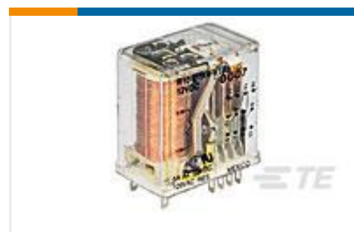
TE Part #2-1393769-7 R10-T1P2-V700=R10