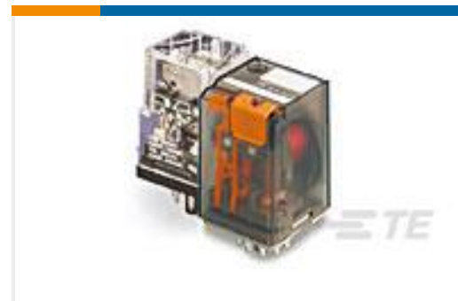
TE Part #1393105-3 KRPA-5DG-12=KRPA