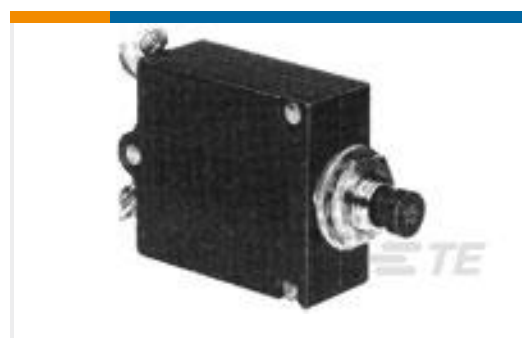
TE Part #6-1393246-7 W23-X1A1G-2=W23/W31