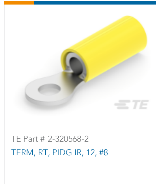
TE Part # 2-320568-2 TERM, RT, PIDG IR, 12, #8