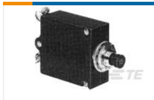
TE Part #6-1393246-5 W23-X1A1G-10=W23/W31