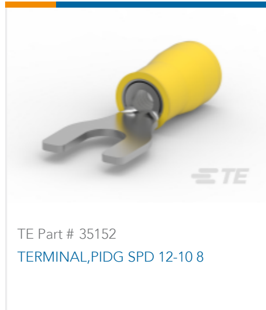
TE Part # 35152 TERMINAL,PIDG SPD 12-10 8