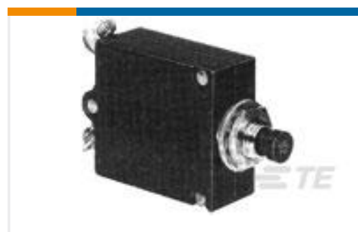
TE Part #6-1393246-9 W23-X1A1G-25=W23/W31