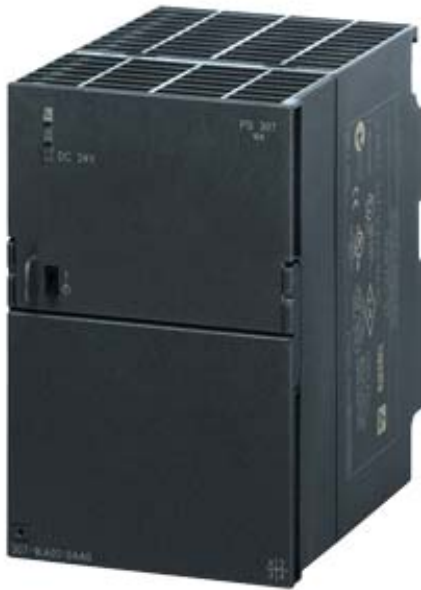
SIMATIC S7-300 STABILIZED POWER SUPPLY PS307 INPUT: 120/230 V AC OUTPUT: DC 24 V DC/10 A