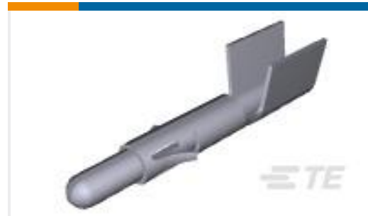
TE Part #350922-6 PIN, MATE-N-LOK, UMNL