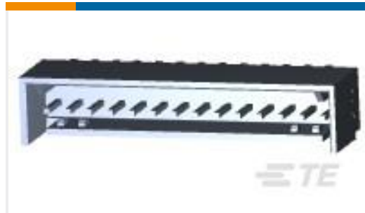
TE Part #3-644861-4 14P MTA100 SHRD HDR,W/O PEG SN