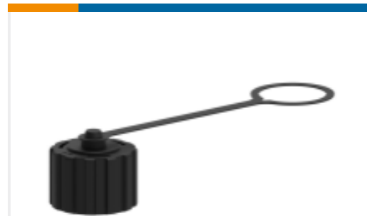
TE Part #2355444-2 RJ45 PROTECTION CAP (PBT)