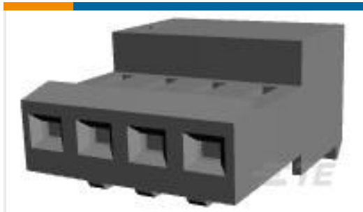
TE Part #3-644574-4 04P MTA100 CONN ASSY BLK LF