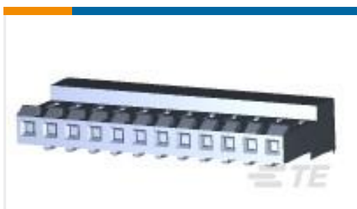
TE Part #4-641217-2 12P MTA156 CONN ASSY 18AWG ORA