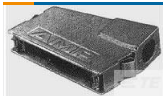
TE Part #749202-2 50 50SR KIT,75D,UK