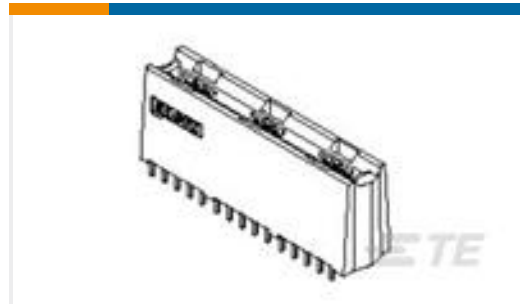
TE Part #6650384-3 286-0052-12301A=TA CONN,SKT