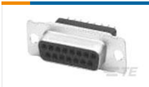
TE Part #745183-7 09 RCPT SP/MS STD