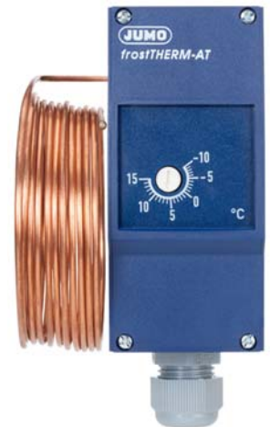
JUMO frostTHERM-AT (STW)

The "Push-In ® " terminal technology allows direct switching of loads up to 16 A at 230 V AC. The installation costs can be reduced further because a contactor is not required.