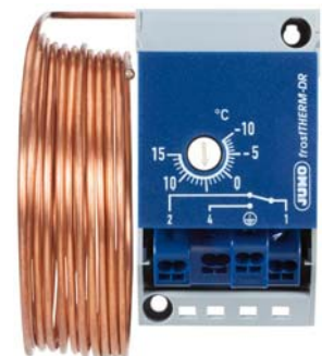
JUMO frostTHERM-DR (STW)