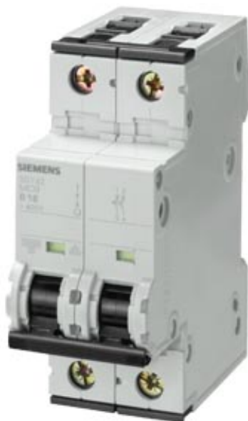
CIRCUIT BREAKER 400V 10KA, 2-POLE, C, 2A, D=70MM