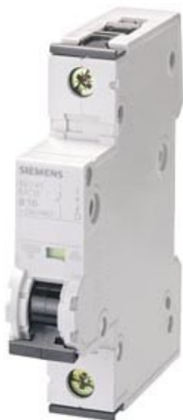
CIRCUIT BREAKER 230/400V 10KA, 1-POLE, C, 16A, D=70MM