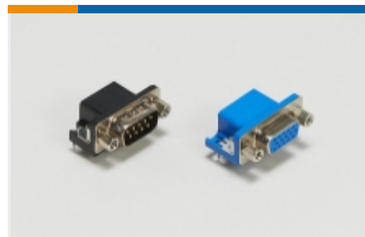
PCB D-Sub Connectors(191)