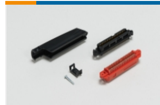
IDC D-Sub Connectors(76)