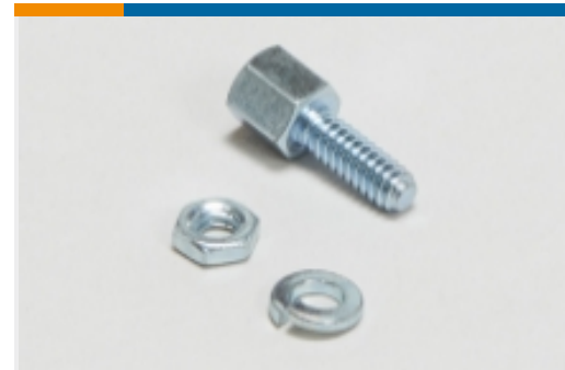
D-Sub Locking &amp; Mounting(8)