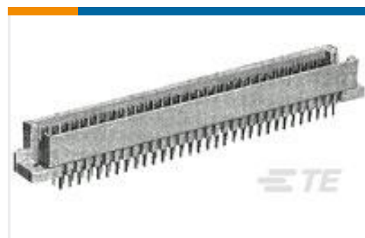
TE Part #650477-5 048 EURO TYPE R PIN ST ASSY