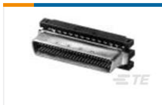
TE Part #5749621-2 26 50S CABLE PLUG CONN/COV KIT