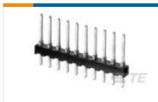
TE Part #87224-3 03 MODII HDR SRST UNSHRD .100