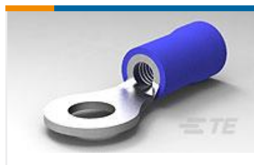
TE Part #34160 TERMINAL,PG R 16-14 8