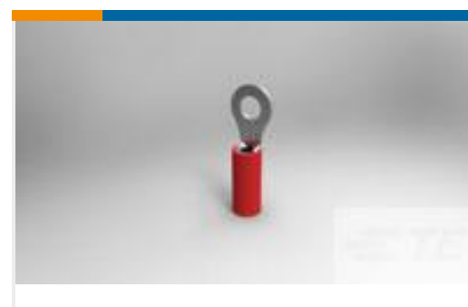
TE Part #51863 PIDG R 22-16 COMM 22-18 MIL 6