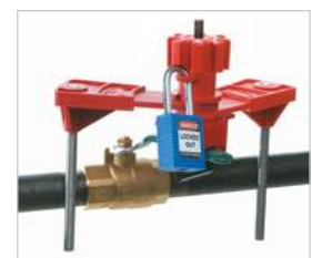
Use two blocking arms to lockout 3-, 4- or 5-way valves, or to lock valves in the throttled position for operational control