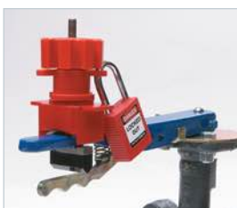
Clamp attaches to butterfly valve lever, preventing trigger handle from being squeezed. Valve cannot be repositioned