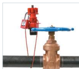
Use cable attachment to lock out gate valves