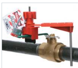
Use blocking arm to lock out quarter-turn ball valves