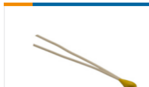
TE Part #GA10K3A11A DISCRETE 10K OHMS, +/-0.1C FROM 0C TO 70C