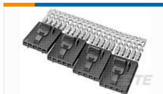
TE Part #5-103957-7 2X8 MTE RCPT SR LATCH .100CL