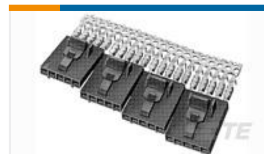
TE Part #5-103958-3 5X4 MTE RCPT SR LATCH .100CL