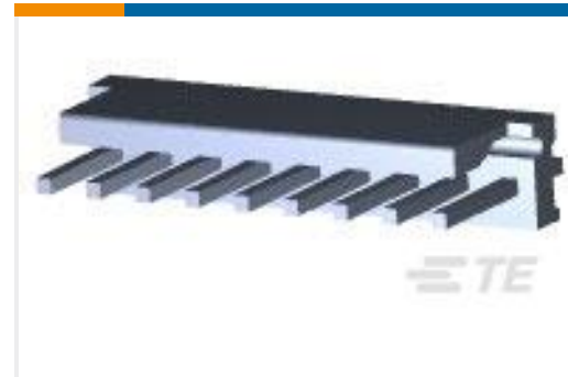
TE Part #640445-9 09P MTA156 HDR ASSY FL/STR SN