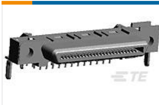
TE Part #6658751-1 .8MM CHAMP, 50 POS, RCPT ASSY