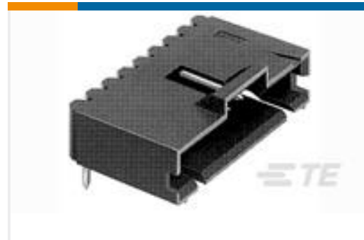
TE Part #5-103634-7 08 MTE HDR SRRA LATCH.100CL LF