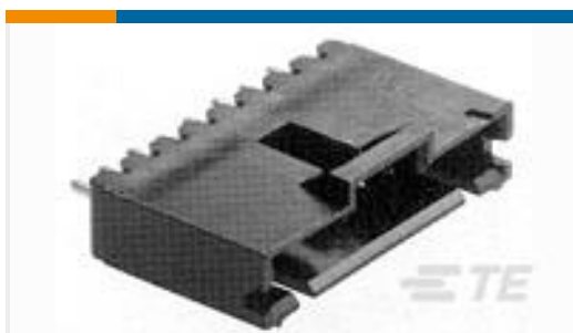
TE Part #6-104909-9 20 MTE HDR SRST LATCH W/HLDWN