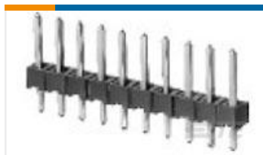
TE Part #5-146280-5 05 MODII HDR SRST B/A .100CL