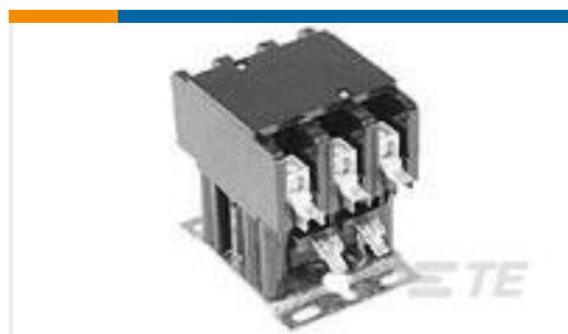
TE Part #4-1611022-9 3100-30J17999CJ=CONTACTOR