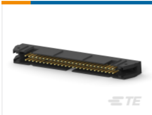
TE Part #1-5499206-0 AMP-LATCH UNIVERSAL HEADERS