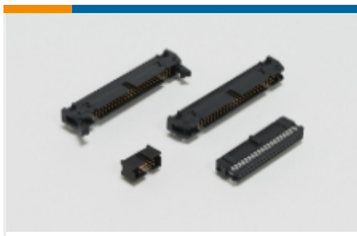
Ribbon Cable Connectors(525)