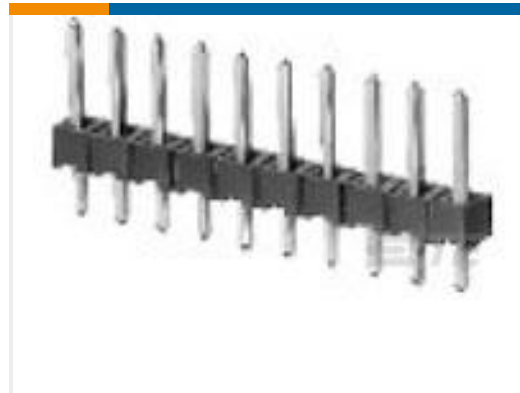
TE Part #5-146293-3 03 MODII HDR SRST B/A 100 W/HD