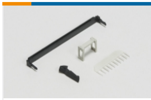
Ribbon Connector Accessories(13)