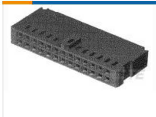
TE Part #102387-2 14 MODIV HSG COMP DR .100 POL