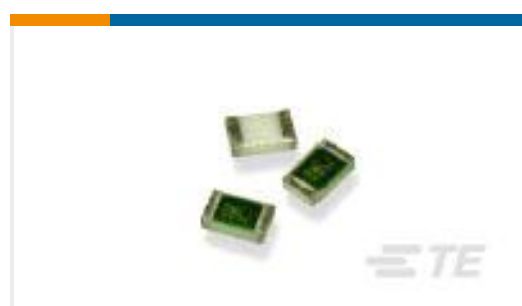
TE Part #2-1614884-6 CPF 0805 24R 0.1% 25PPM 1K RL