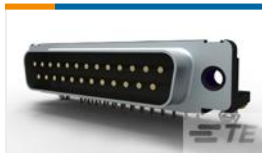
TE Part #5747842-4 25 MSFL PLUG RA 318 (IN,FM,BL)