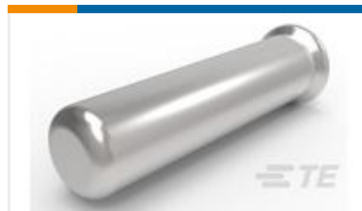
TE Part #50462-6 SOCKET,MIN-SPR AU SER-2