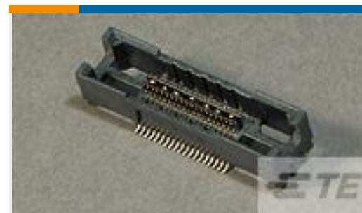
TE Part #2-767004-2 MICT,RECPT,038,ASSY,.025,REC