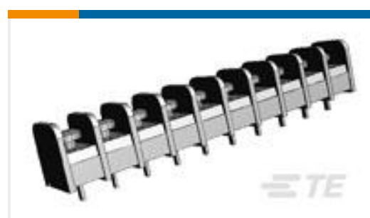
TE Part #1-1437664-4 NC6-P107-10=NC6 ASSEMBLY