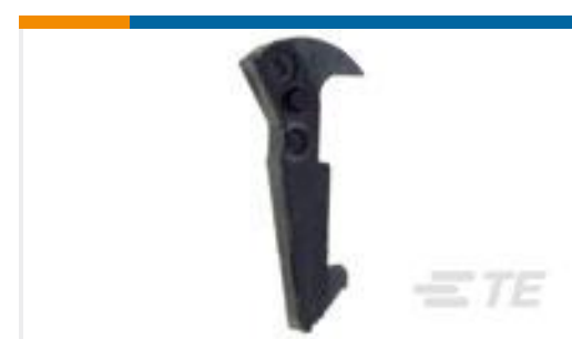
TE Part #102320-1 UNIVERSAL HEADER LATCH