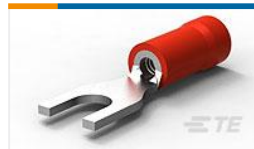
TE Part #327043 PG SPD 22-16 COMM 22-18 MIL 6