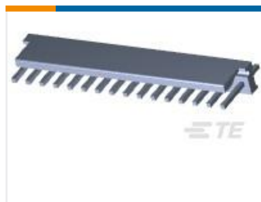
TE Part #1-644752-6 16P MTA156 HDR ASSY SQ STR F/L