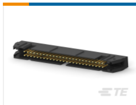
TE Part #5102153-6 AMP-LATCH UNIVERSAL HEADERS