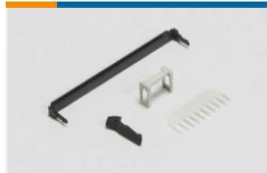
Ribbon Connector Accessories(13)