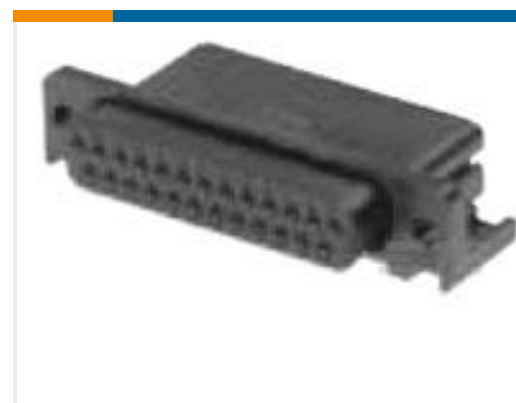
TE Part #5747460-5 HD-20 RCPT 15P RA 590 FFSCRLK