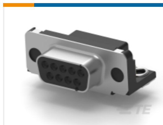
TE Part #5747459-4 D-Sub Receptacle Assembly: Right Angle, Shell Size 1, 2.74mm