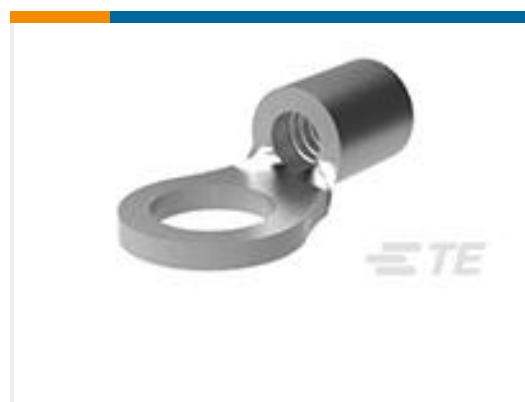
TE Part #2-31090-1 BUDG R 22-16 COMM 22-18 MIL 5