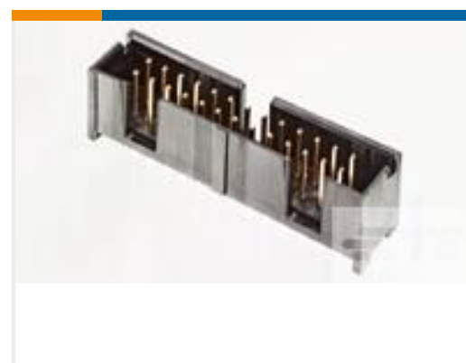
TE Part #1-1761681-3 IDC LOW PRO HDR 40P VERT HT BLACK