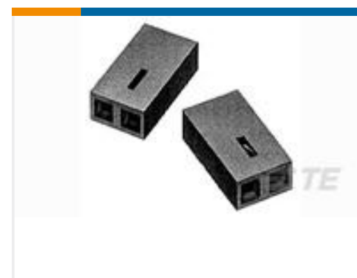
TE Part #2-530153-2 TDM SPRING, SHUNT ASY 2 POS