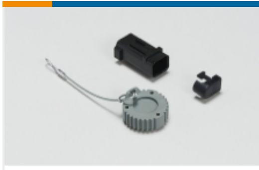
Automotive Connector Caps & Covers (32)