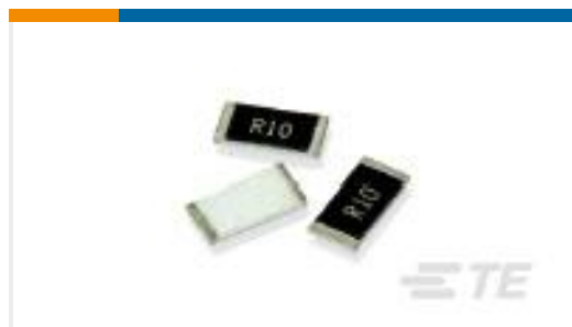
TE Part #7-1622825-6 RL73K 2E R10 5% 5K RL