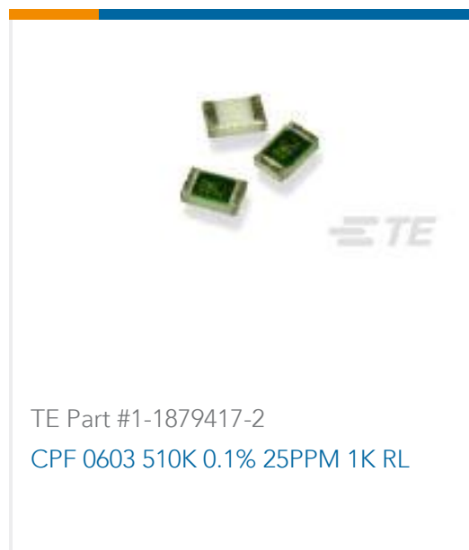
TE Part #1-1879417-2 CPF 0603 510K 0.1% 25PPM 1K RL