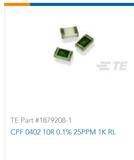
TE Part #1879208-1 CPF 0402 10R 0.1% 25PPM 1K RL