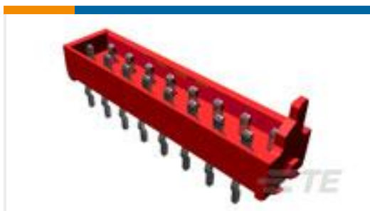
TE Part #215464-4 04P.MICRO-MATCH MOB