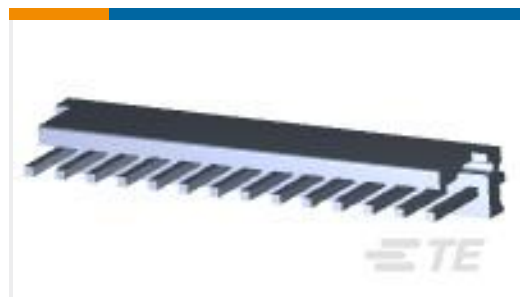
TE Part #1-640445-4 14P MTA156 HDR ASSY FL/STR SN