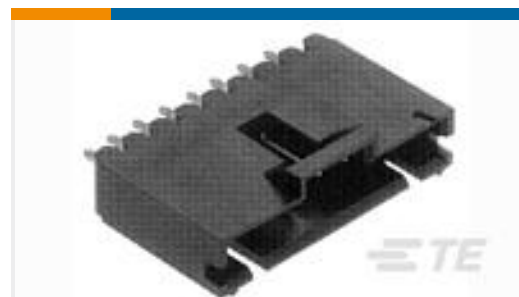
TE Part #5-103639-4 05 MTE HDR SRST LATCH .100CL