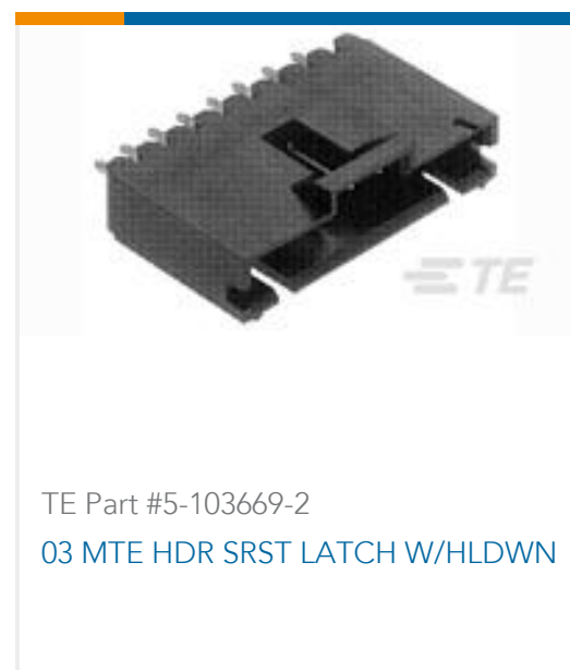
TE Part #5-103669-2 03 MTE HDR SRST LATCH W/HLDWN