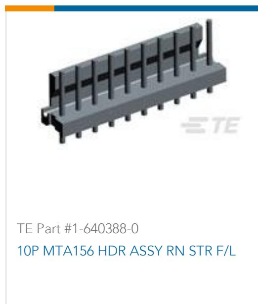
TE Part #1-640388-0 10P MTA156 HDR ASSY RN STR F/L