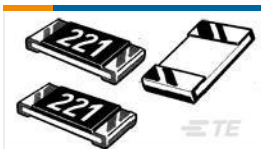
TE Part #3-2176070-0 3521 160R 1% 2W