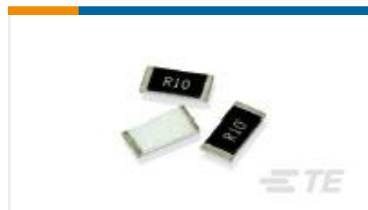
TE Part #1-2176056-7 RLP73M 2B R047 5% 5K RL