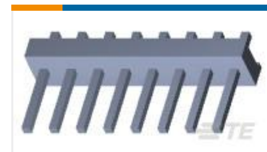
TE Part #640383-8 08P MTA156 HDR ASSY STR SQ SN