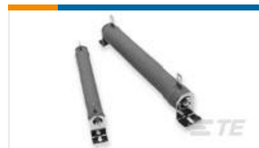
TE Part #2-1879453-9 TE 1000W 220R 5% Bracket