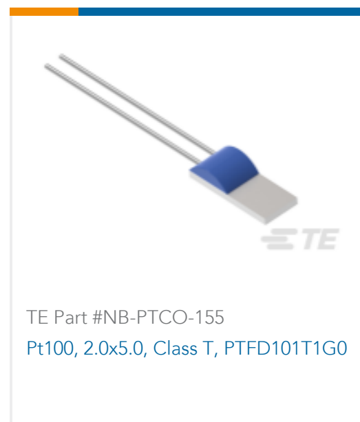
TE Part #NB-PTCO-155 Pt100, 2.0x5.0, Class T, PTFD101T1G0