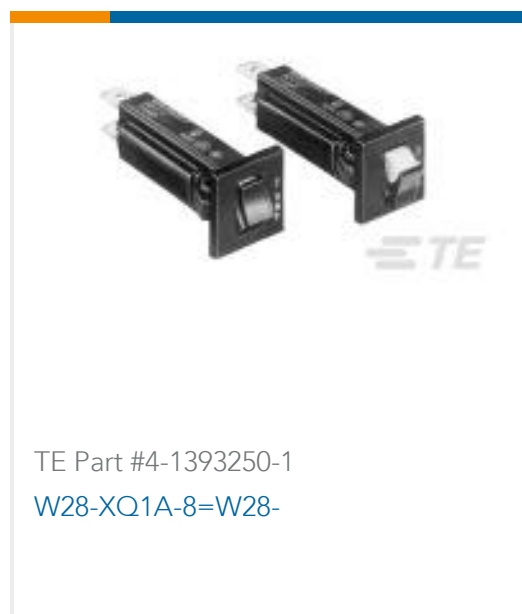
TE Part #4-1393250-1 W28-XQ1A-8=W28-