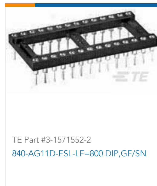
TE Part #3-1571552-2 840-AG11D-ESL-LF=800 DIP,GF/SN