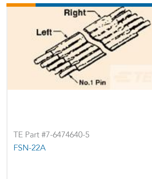
TE Part #7-6474640-5 FSN-22A