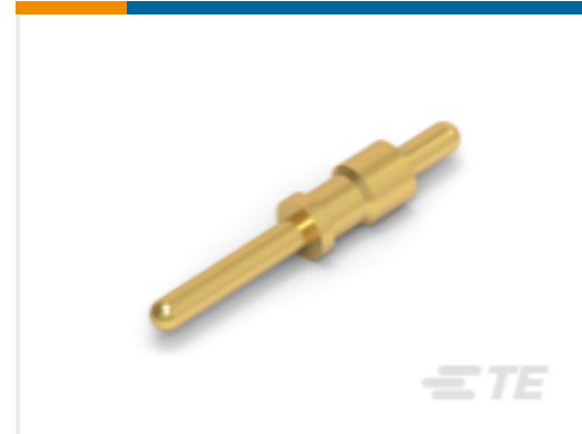
TE Part #1650060-2 707-16-02109=CONTACT,PIN,#12