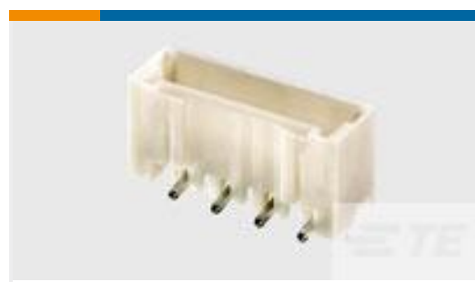
TE Part #292232-4 1.5 MINI CT SGL V SMT W/BOS,PO