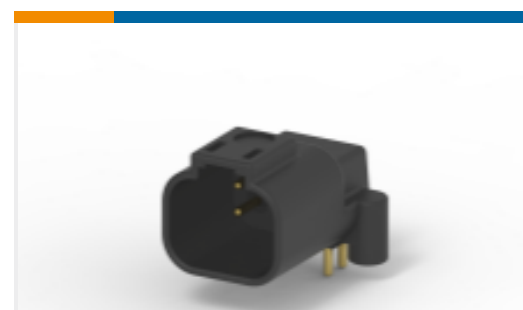
TE Part #DTF13-4P-G003 HDR, 4P, GRY, RA, AU/NI/CU