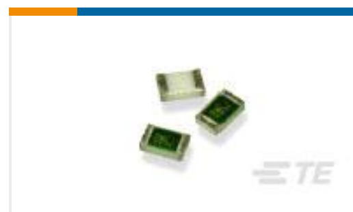
TE Part #8-1879214-1 CPF 0402 2K55 0.1% 25PPM 1K RL