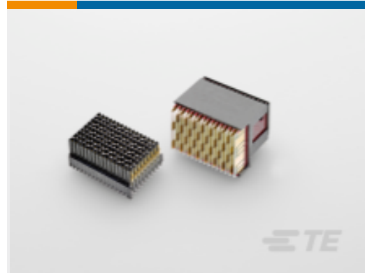
TE Part #2302785-2 RA PLUG ASSY,7ROW,CENTER,VPX, MG RT3