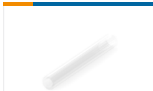
TE Part #NB15964001 RT-375-1/4-X-SP