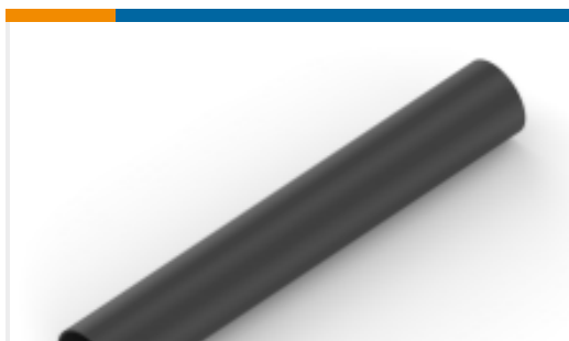
TE Part #NB13892001 TAT-125-1/2-0-STK