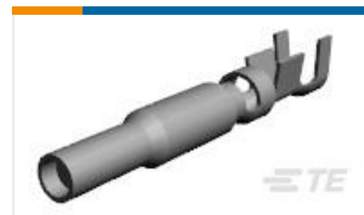
TE Part #770251-4 UMNL II SOK SN/AUNI/PHBZ LP