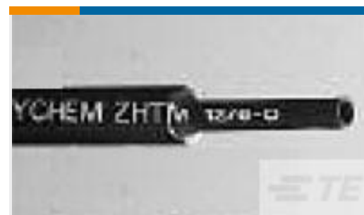
TE Part #2023374003 ZHTM-5/2.5-0-SP