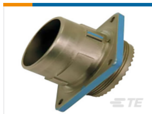
TE Part #YDIV46E19-32PAC003 PLUG ASSY