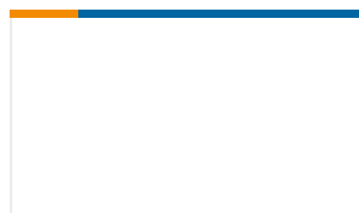
TE Part #CTS-S16-16 CONT SOC ASSY