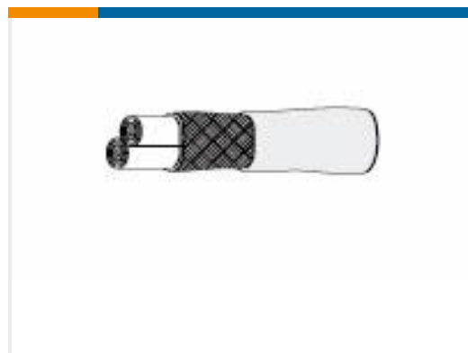
TE Part #316203-000 55A1131-20-2/6/9-9