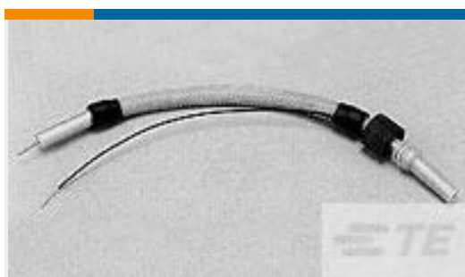
TE Part #862545-8 LEAD, SGL END ASSY, LGH