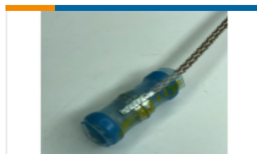
TE Part #209036-001 SO63-4-W1-24-9-100CS2870