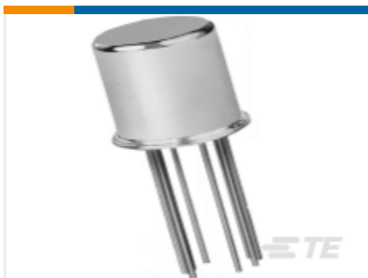
TE Part #1-1617162-5 J1MAPT-18XM = M28776/5-023M