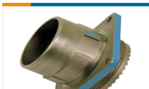
TE Part #YDIV43E23-21PAC009 RECP ASSY