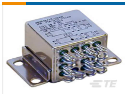
TE Part #1617756-3 FCA-410-CY2