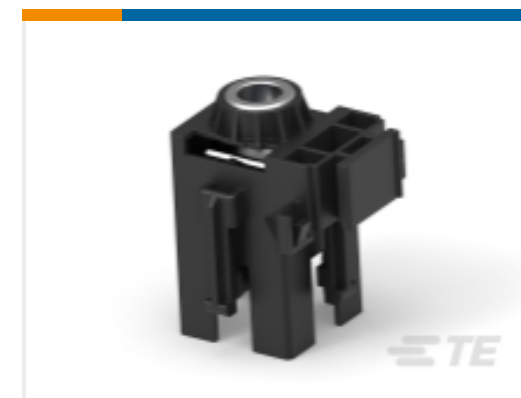
TE Part #444309-1 HSG ASS'Y POWER/GRO