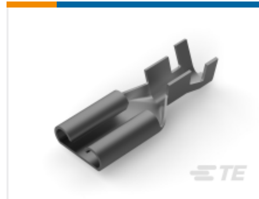
TE Part #881606-2 FF 375 RECEPTACLE 4.0-6.0 MM2 1.01 TPBR