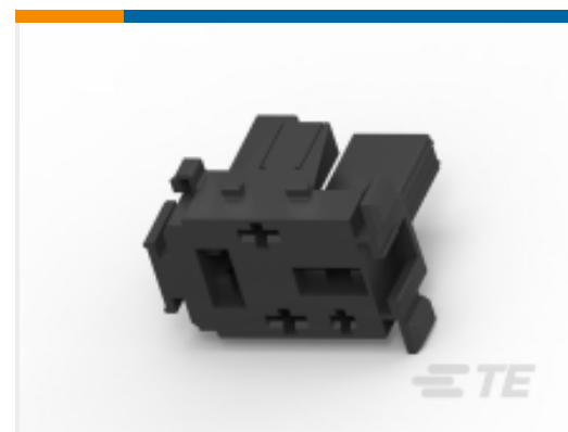
TE Part #1480838-1 MAXI RELAY SUPORT