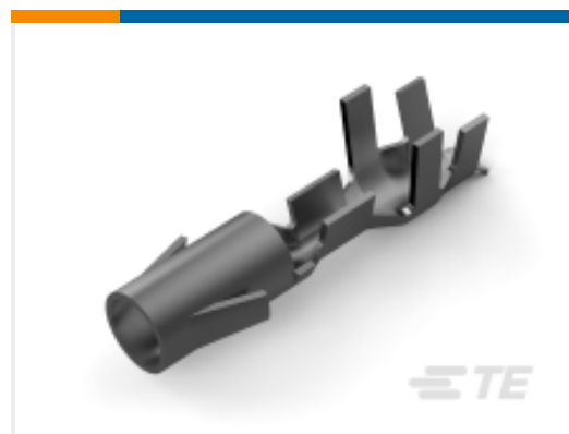
TE Part #880686-2 .140 DIA SOCKET