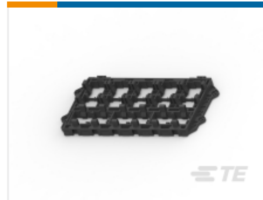
TE Part #444308-1 FRAME, FUSE/RELAY B