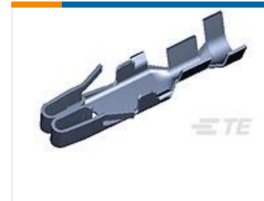
TE Part #880398-2 FUSE CONTACT