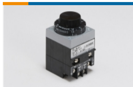
Time Delay Relays(176)