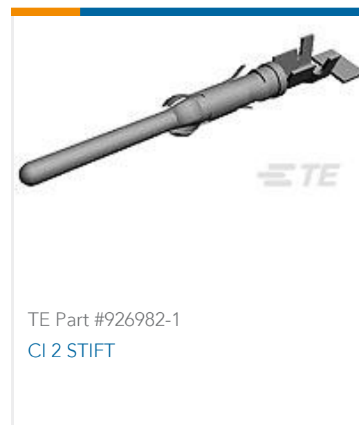
TE Part #926982-1 CI 2 STIFT