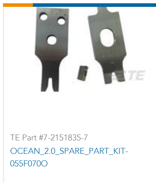
TE Part #7-2151835-7 OCEAN_2.0_SPARE_PART_KIT- 055F0700