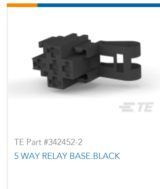
TE Part #342452-2 5 WAY RELAY BASE.BLACK