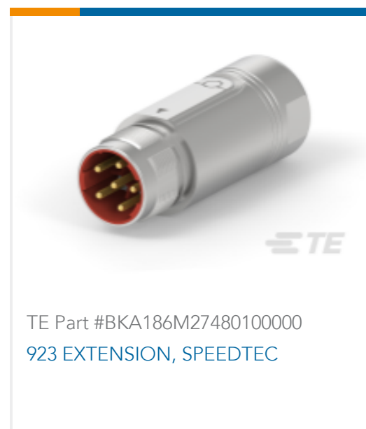
TE Part #BKA186M27480100000 923 EXTENSION, SPEEDTEC