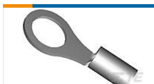
TE Part #34121 TERMINAL,SOLIS R 16-14 6