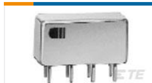
TE Part #2-1617030-7 HFW1201G01M = M39016/6-116M