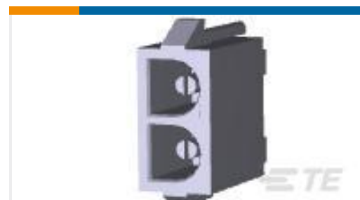
TE Part #641963-1 02P UMNL PIN HDR ASSY POL NATL