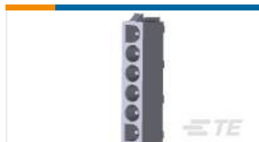
TE Part #643407-1 06P UMNL PIN HDR ASSY POL NATL