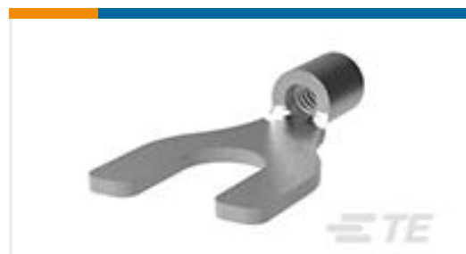
TE Part #34118 SOLIS SPD 22-16COMM22-18MIL 10