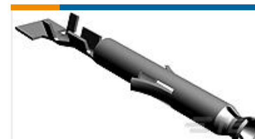
TE Part #1-770834-0 MINI UMNL SOK AU LF