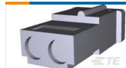
TE Part #1-480683-0 02P CMNL PLUG HSG F/H NATL