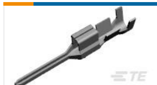
TE Part #917764-1 2.5 SIGNAL D/LOCK TAB CONT. L