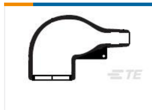
TE Part #131250-000 222K132-25/225-0