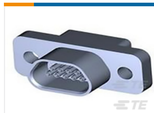
TE Part #1532206-2 M83513/02-FC, MCKS-C2-B-37SS