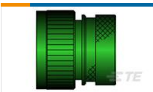
TE Part #203367-000 202M210-19B