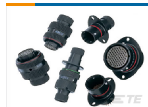
TE Part #AS012-98SN RECEPT.2 HOLE MNT.TYPE 0