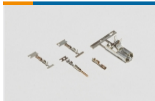
Wire-to-Board Connector Contacts(6)