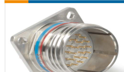
TE Part #YDTS20G25-35SNV001 RECP ASSY