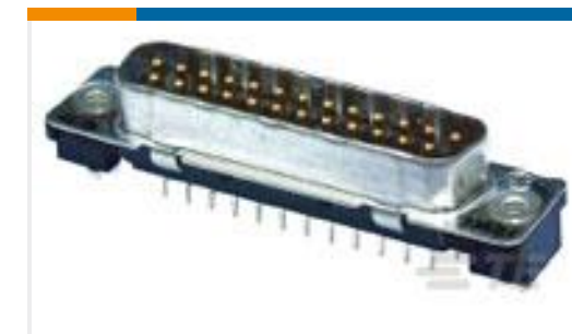
TE Part #3-338311-2 25POS.HD20 PLG ASSY