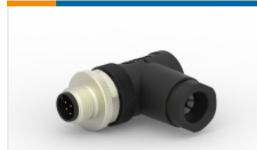
TE Part #T4113002081-000 M12,MALE,RA,A CODE,8P,PG9,GOLD