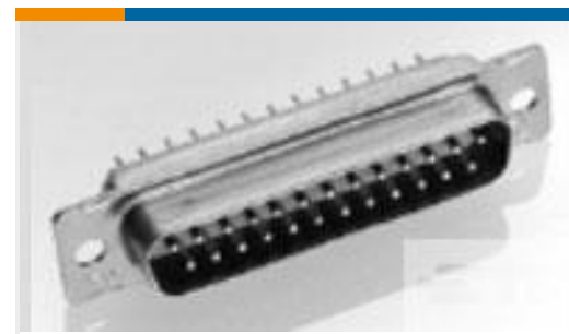
TE Part #204505-1 AMPLIMITE,ASY,PLUG,STD,90,3