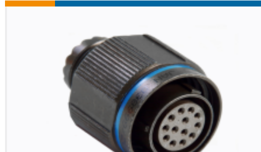
TE Part #YDTS26F09-98PNV001 PLUG ASSY