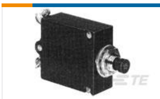
TE Part #6-1393246-9 W23-X1A1G-25=W23/W31-