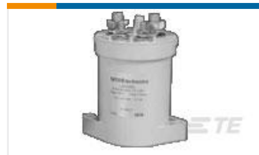
TE Part # 9-1618389-8 LEV100A5ANG=RELAY, SPST, 24Vdc