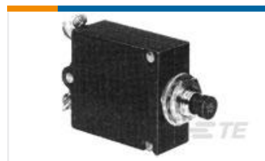
TE Part #7-1393246-2 W23-X1A1G-35=W23/W31