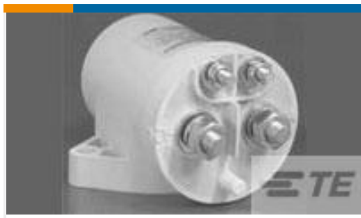
TE Part # 1618387-5 LEV200A4NAF=RELAY, SPST-NO