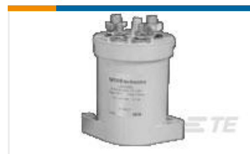
TE Part #5-1618388-4 LEV200A4ANF=RELAY, SPST-NO