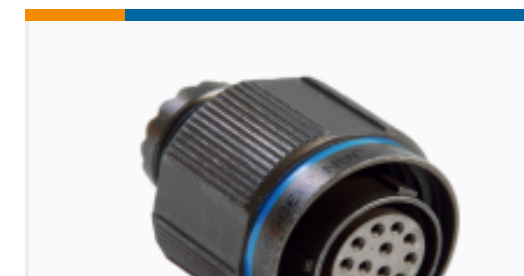
TE Part #YDTS26F09-35PNV001 PLUG ASSY