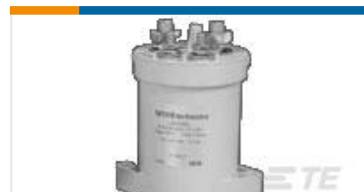
TE Part #5-1618388-8 LEV200A6NAA=RELAY, SPST-NO