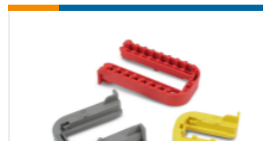
TE Part #1564411-6 Heavy Duty Sealed Connector Series Fixing Slides