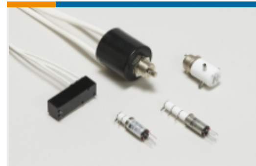
High Voltage Relays(3)