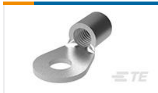
TE Part #32996 TERMINAL,SOLIS R 8 8