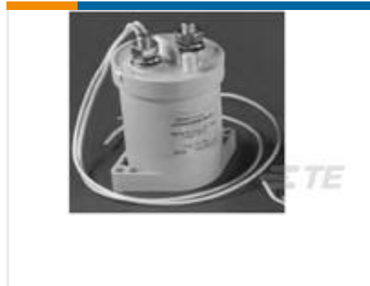
TE Part # 6-1618385-2 LEV200A9ANA=RELAY, SPST, 240V COIL