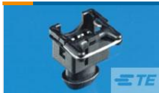
TE Part #347887-3 2 WAY JUNIOR TIMER CONN.