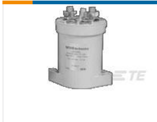
TE Part # 1618387-3 LEV200A4ANA=RELAY, SPST-NO