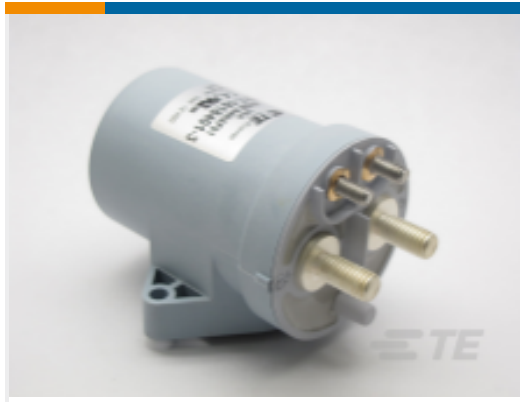
TE Part # 7-1618401-3 LEV200A4NAF01=Contactor, w/Coil Sup