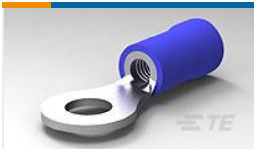
TE Part #34160 TERMINAL,PG R 16-14 8