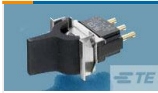
TE Part #3-6437630-7 FLN19BLACK04=LEVER ACTION SWITCH