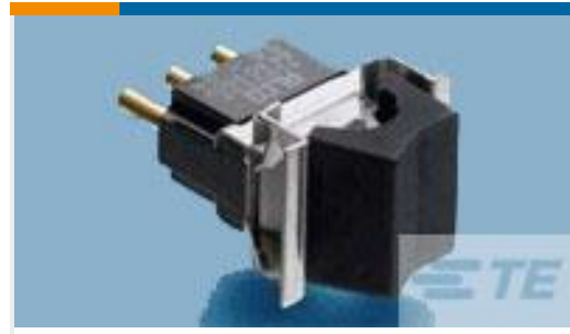
TE Part #4-6437630-7 FLN29RED04=ROCKER ACTION SWITCH