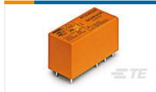
TE Part #1649329-1 RTE24005