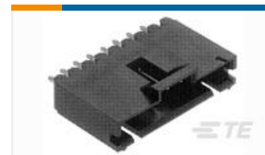
TE Part #6-103639-3 14 MTE HDR SRST LATCH .100CL