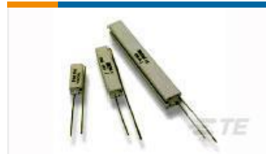
TE Part #1623732-7 BCHE 7 W 150R 5%