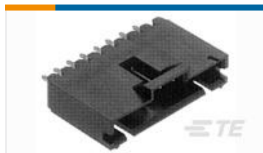
TE Part #5-103669-8 09 MTE HDR SRST LATCH W/HLDWN