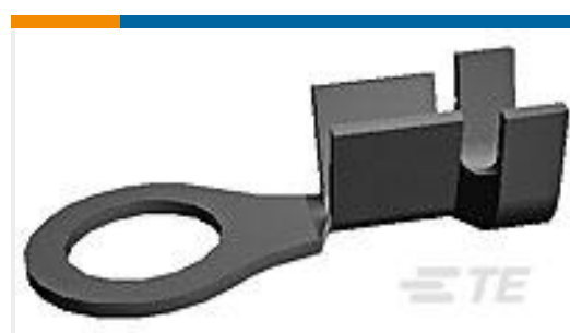
TE Part #41581 RT .171 DIA TERMINAL 24-20 AWG TPBR