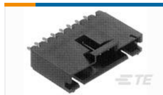
TE Part #5-103669-5 06 MTE HDR SRST LATCH W/HLDWN