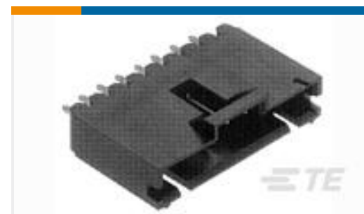
TE Part #5-103669-4 05 MTE HDR SRST LATCH W/HLDWN