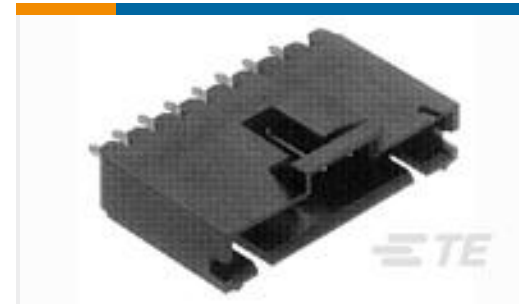
TE Part #5-103908-9 10 MTE HDR SRST LATCH W/HLDWN