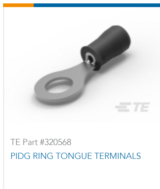
TE Part #320568 PIDG RING TONGUE TERMINALS