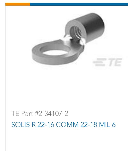
TE Part #2-34107-2 SOLIS R 22-16 COMM 22-18 MIL 6