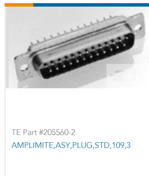
TE Part #205560-2 AMPLIMITE,ASY,PLUG,STD,109,3