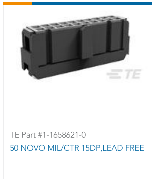
TE Part #1-1658621-0 50 NOVO MIL/CTR 15DP,LEAD FREE