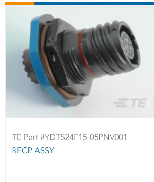
TE Part #YDTS24F15-05PNV001 RECP ASSY