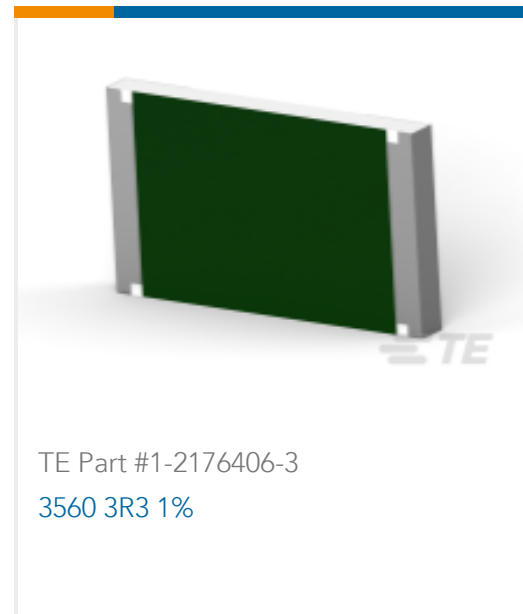
TE Part #1-2176406-3 3560 3R3 1%