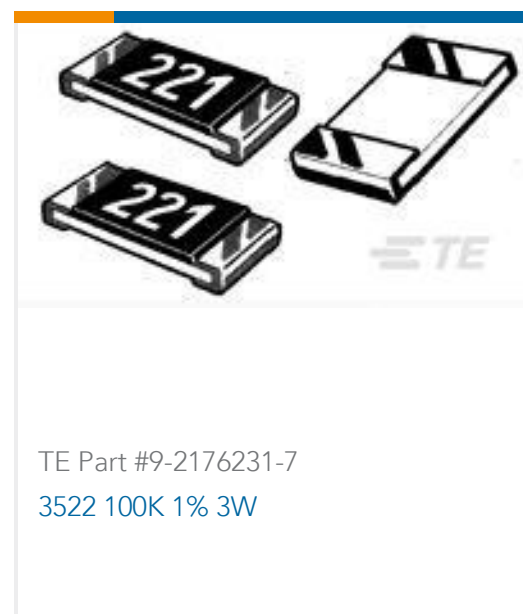
TE Part #9-2176231-7 3522 100K 1% 3W