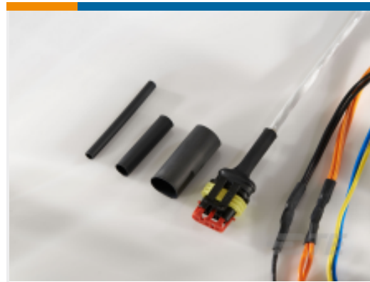
TE Part #EH2289-000 DWFR-6/2-0-STK