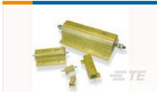
TE Part #8-1625999-9 HSC100 120R 5%