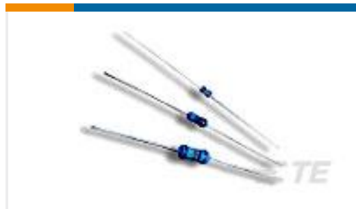
TE Part #1879026-4 YR1 0.1% 10R