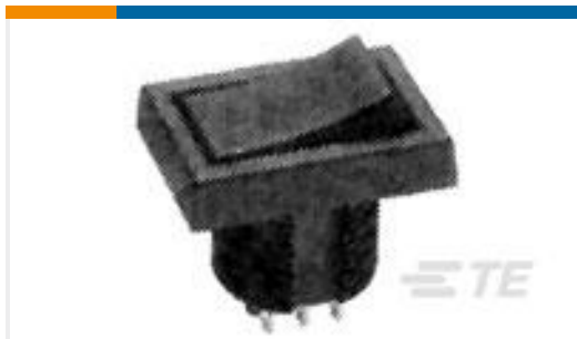
TE Part #1437596-3 TRD21N10WL=DPDT ROCKER BLACK