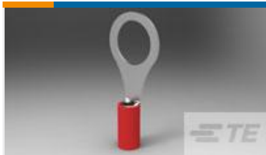
TE Part #328975 PIDG R 22-16COMM 22-18MIL 1/2