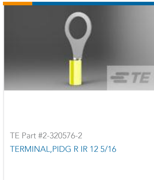
TE Part #2-320576-2 TERMINAL,PIDG R IR 12 5/16