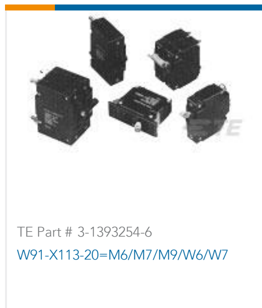
TE Part # 3-1393254-6 W91-X113-20=M6/M7/M9/W6/W7