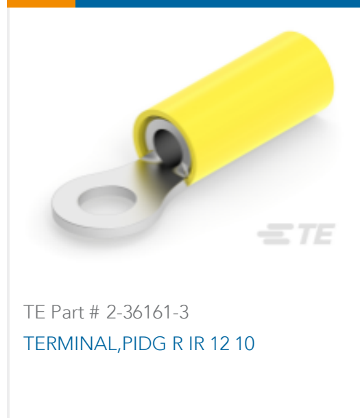
TE Part # 2-36161-3 TERMINAL,PIDG R IR 12 10