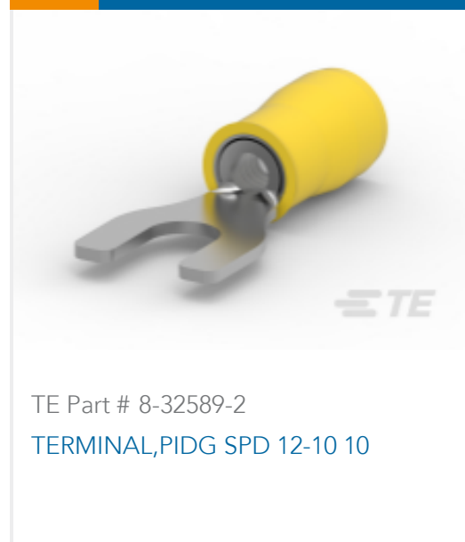
TE Part # 8-32589-2 TERMINAL,PIDG SPD 12-10 10