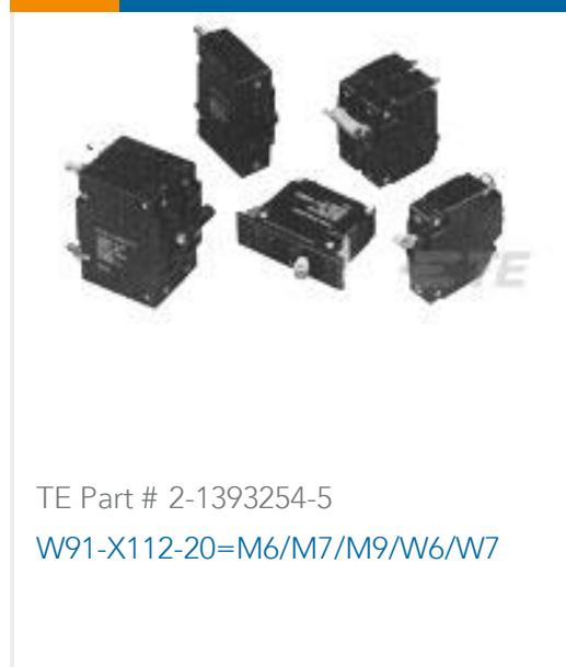
TE Part # 2-1393254-5 W91-X112-20=M6/M7/M9/W6/W7