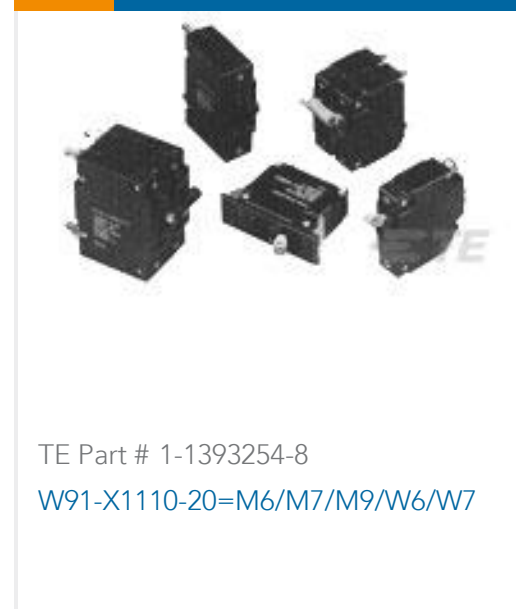
TE Part # 1-1393254-8 W91-X1110-20=M6/M7/M9/W6/W7