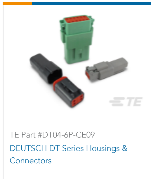
TE Part #DT04-6P-CE09 DEUTSCH DT Series Housings & Connectors