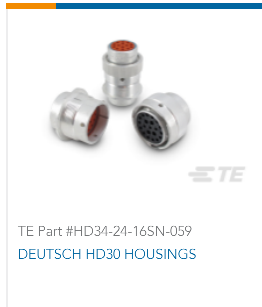
TE Part #HD34-24-16SN-059 DEUTSCH HD30 HOUSINGS