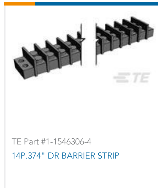
TE Part #1-1546306-4 14P.374" DR BARRIER STRIP