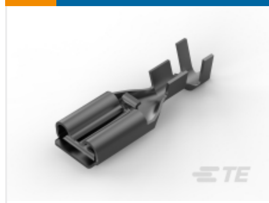
TE Part # 175022-1 250 PL EX REC. 18-14AWG PTBR