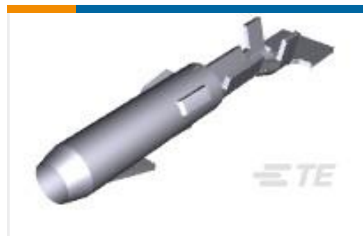
TE Part #61173-5 CMNL SOK 30-22 AUNIBR L/P