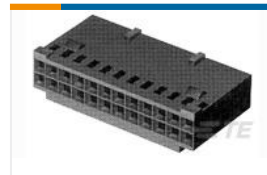
TE Part #1-87631-9 24 MODIV HSG COMP DR .100 POL