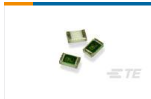
TE Part #5-1879208-7 CPF 0402 2K2 0.1% 25PPM 1K RL