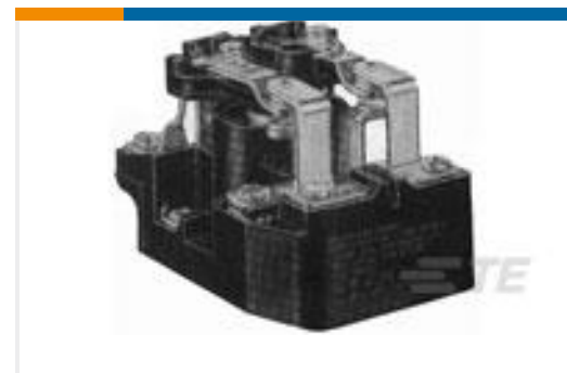
TE Part #4-1393127-9 PRD-11DH0-24=PRD