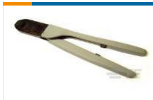
TE Part #91515-1 CCI TYPE III+ MNL PIN SKT 30-20 ASSY