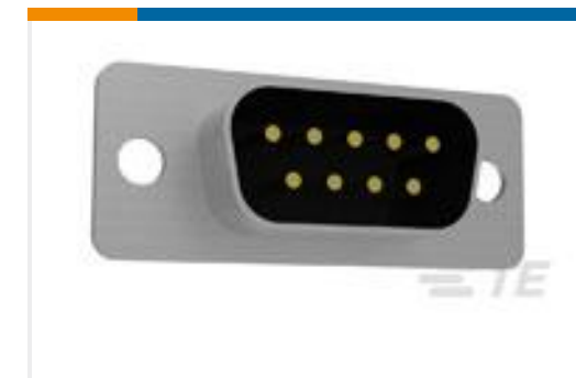
TE Part #5-747904-2 9 Plug Solder Cup, Gold Flash,