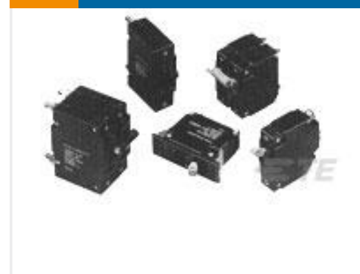
TE Part # 2-1393253-9 W68-X2Q12-10=M6/M7/M9/W6/W7