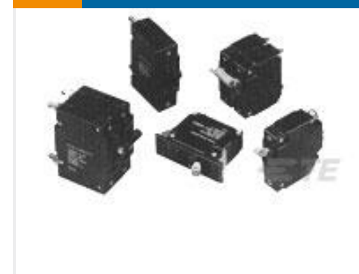
TE Part # 3-1393253-8 W68-X2Q12-5=M6/M7/M9/W6/W7