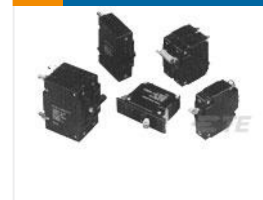
TE Part # 6-1423698-9 W68-X2Q12-7V=CKTBKR,MAGHYD, LEVER,QC.250