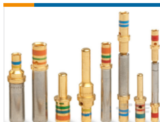
TE Part #ZPF000000000003651 724-8022-16