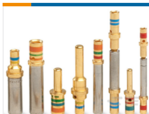
TE Part #ZPF000000000003647 724-8021-12