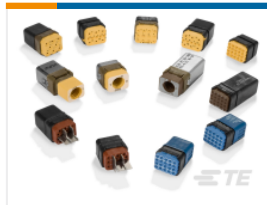
TE Part #ZPF000000000015318 DMC-M 20-22 SN