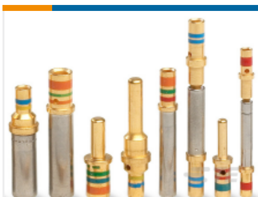
TE Part #ZPF000000000003648 724-8021-16