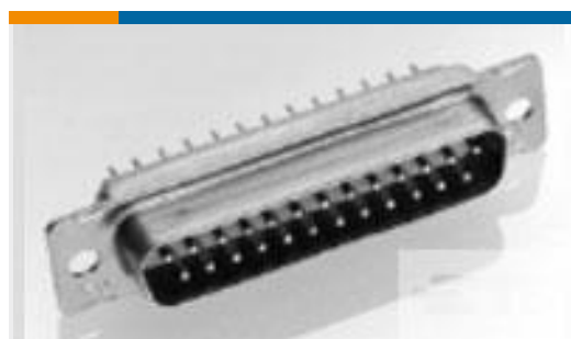
TE Part #1218124-2 15 POS, ASSY, PLUG, LOW PROF, 109